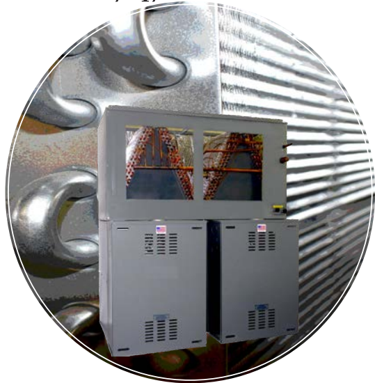
Commercial Coil 'ABM' shown attached to two furnaces

*RP29004- R32/R454B Dual Sensor Kit *RP29004- Commercial A2L Kit